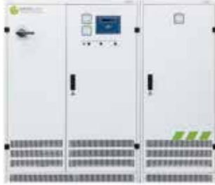
BTS Battery Testing

Greenlight's Multi-Channel BTS includes Emerald™ battery test control software, capable of fully automated testing, remote monitoring and remote control. Emerald™ Automation Language with Load Cycle Importer software allows users to translate standard or user-generated load cycle test data directly into automated test scripts.