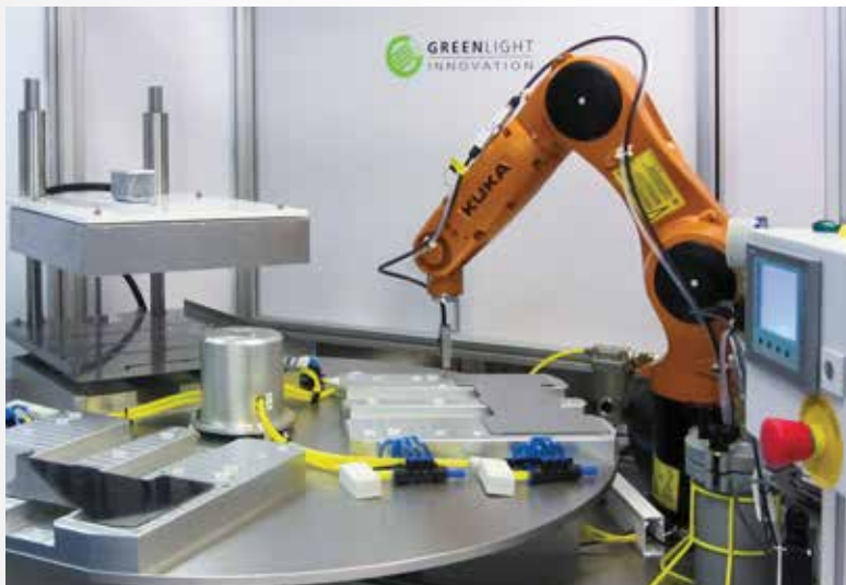
Robotic Cell Assembly