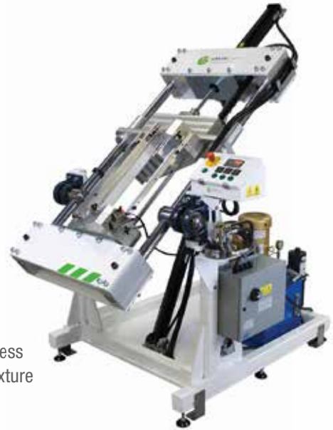
Fuel Cell Stack Assembly Press with Integrated Leak Test Fixture