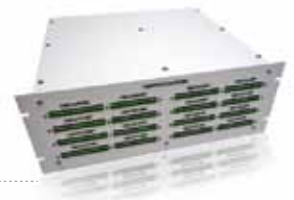
Cell Voltage Monitoring System