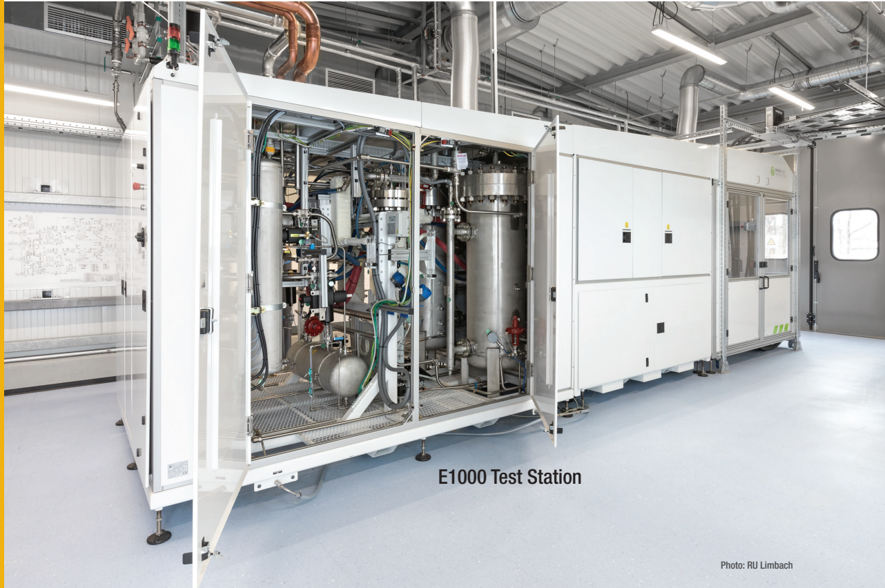
E1000 Test Station