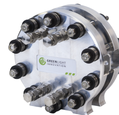
PEM Electrolyser Research Hardware