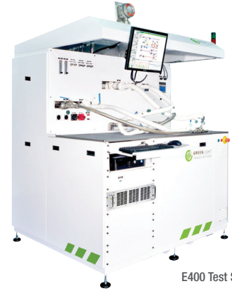
E400 Test Station