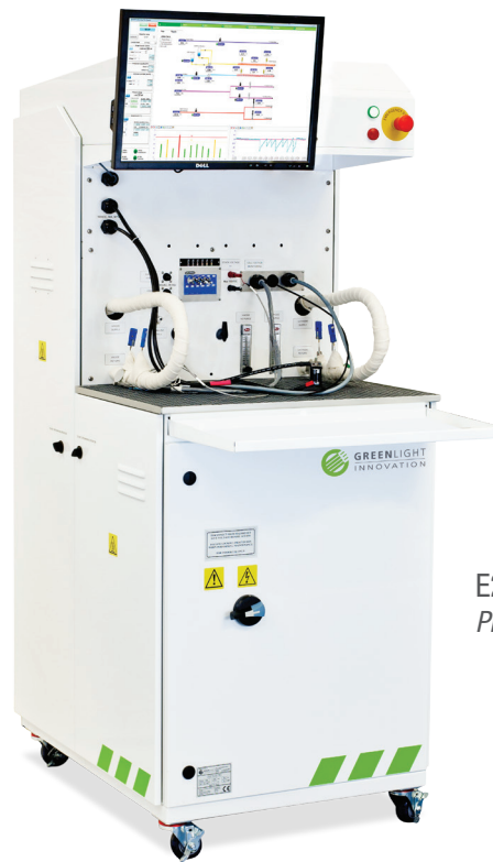
E20 ETS Single Cell Test Station PEM and AEM Versions Available