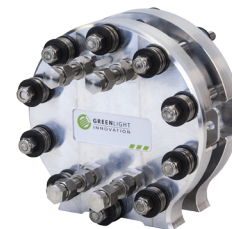
PEM Electrolyser Research Hardware

© Greenlight Innovation Corporation, Burnaby, B.C. Canada. All specifications and illustrations contained in this brochure are based on the latest product information available at the time of printing. Greenlight reserves the right to make changes at any time without notice in materials, equipment, specifications and models. Printed in Canada.